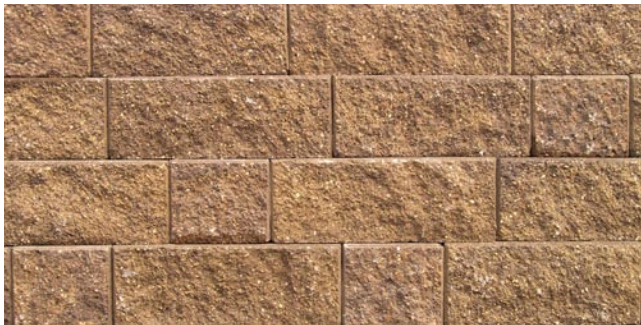
Ultra - Standard - Cobble Pattern

VERSA-LOK Ultra units create additional options for random-pattern walls.