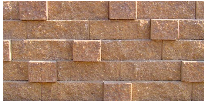
Ultra - Cobble Pin-Forward Pattern

Expand your opportunities with Ultra, the newest member of the VERSA-LOK family.